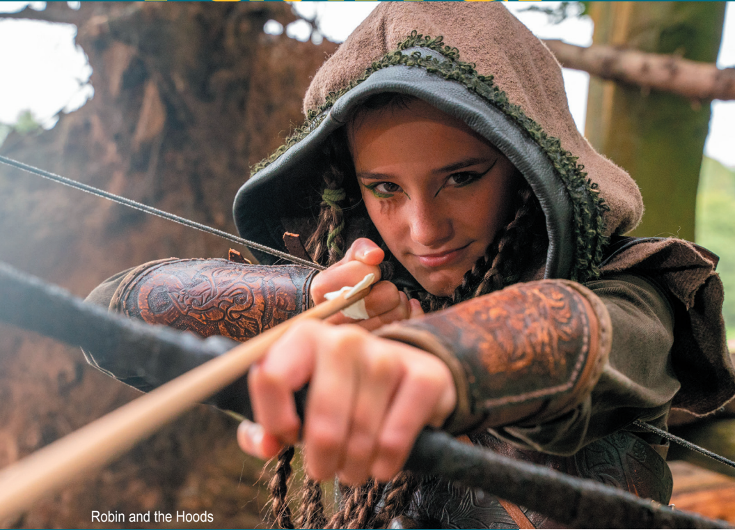
Robin and the Hoods